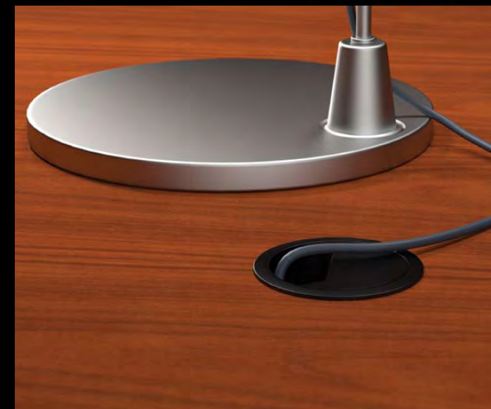
EXTENSIVE CORD MANAGEMENT IS FOUND THROUGHOUT THE BRIGHTON SERIES, A FEATURE NOT FOUND ON MANY COMPARABLY PRICED LINES.