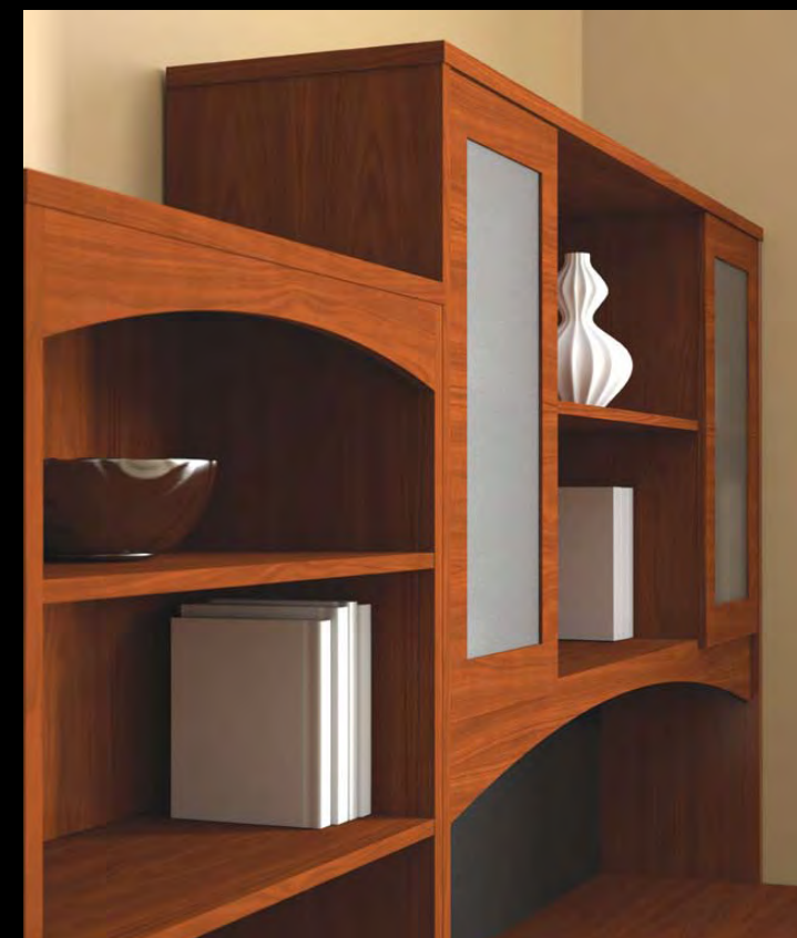
CURVED ACCENTS ARE FOUND THROUGHOUT THE BRIGHTON LINE ON SUCH ELEMENTS AS THE MODESTY PANELS, BRIDGE SURFACES, AND HUTCH AND BOOKCASE APRONS.