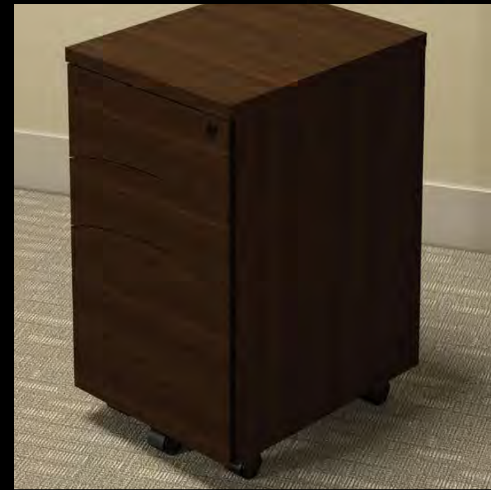
MOBILE PEDESTALS WITH CONCEALED PULLS ARE AVAILABLE FOR FULL HEIGHT APPLICATIONS. THEY SLIDE EASILY UNDER DESK SURFACES OR STAND ALONE.