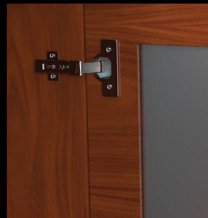
ALL OF BRIGHTON'S CABINET AND HUTCH DOORS FEATURE PRE-INSTALLED, SELF CLOSING EUROPEAN STYLE HINGES.