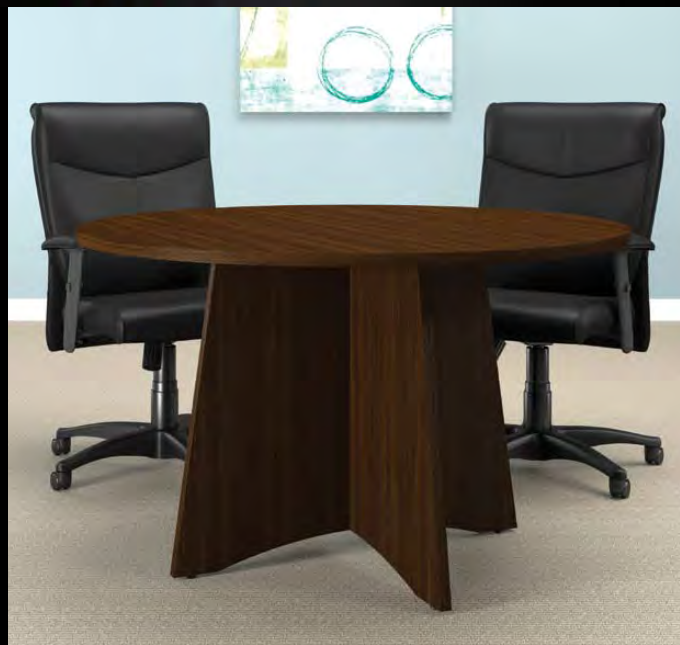
42" ROUND TABLES ARE ALSO AVAILABLE FOR SMALL CONFERENCE ROOMS OR PRIVATE OFFICES.