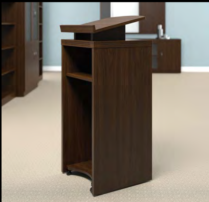
THE ABERDEEN MOBILE LECTERN FEATURES TWO CONCEALED STORAGE COMPARTMENTS WITH AN ANGLED DOCUMENT SHELF.