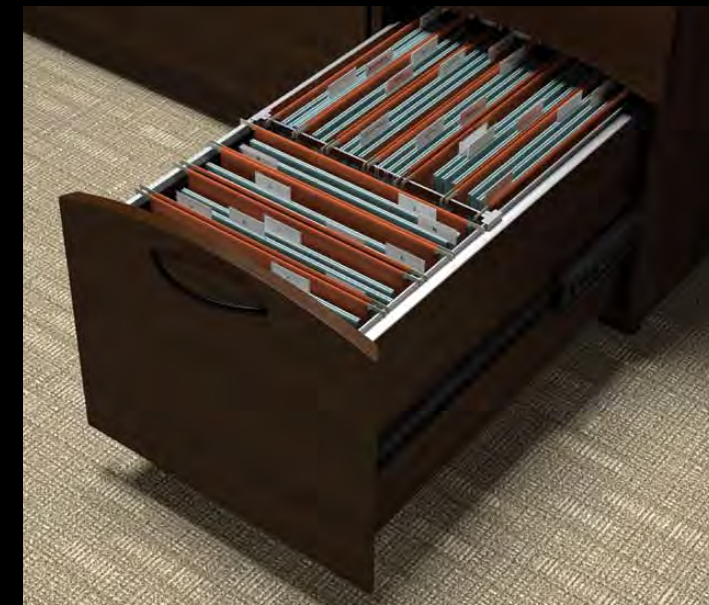
PEDESTALS ARE UNIVERSAL FOR RIGHT OR LEFT OR RIGHT CONFIGURATIONS AND DRAWER FRONTS ARE PREDRILLED FOR OPTIONAL HANDLES, AS SHOWN.