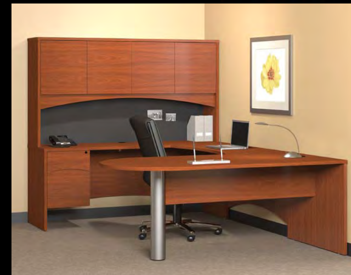
SINGLE-HEIGHT WOOD DOOR HUTCHES ARE OFFERED, AS WELL AS PENINSULA DESKS FOR EXTREMELY AFFORDABLE PRIVATE OFFICE CONFIGURATIONS.